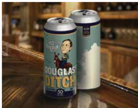
Douglas' Ditch is a lager being sold at four breweries in Allegany County as part of the Libations Trail.

Check out the C&O Canal Libations Trail at www.CanalLibations.com on your next visit to the C&O Canal!