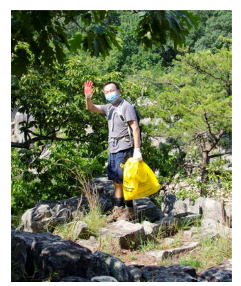
On Billy Goat Trail A

The outbreak of the pandemic in early March forced the C&O Canal Trust to cancel its Canal Pride Days events scheduled for the spring. Over the same period, unprecedented numbers of people flocked to the Park to seek respite from the pandemic, resulting in increased stress on the Park's infrastructure as well as a serious trash problem.