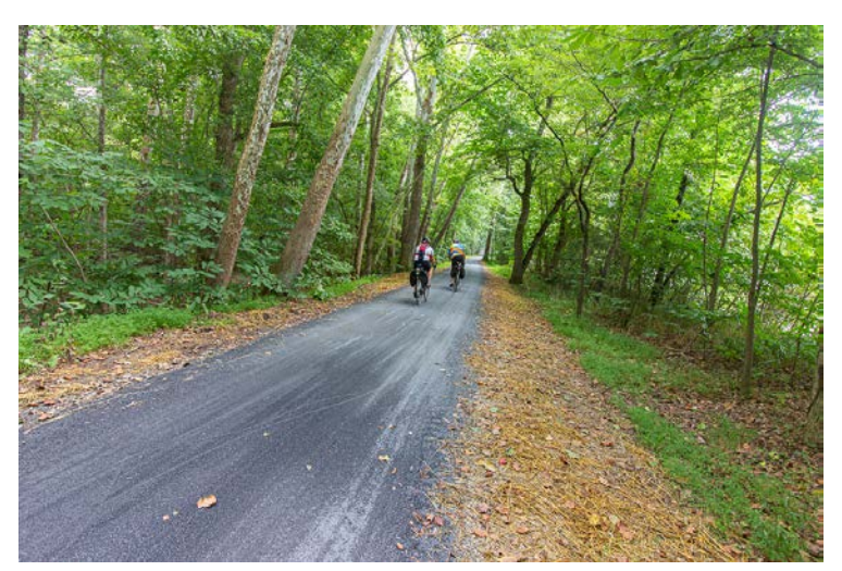
Towpath near Antietam Aqueduct

C&O Canal Trust donors contributed over $36,000 in FY20 to support the project. Those donations were used to support an engineering consultant to work with contractors to ensure that the new surface meets the highest standards.