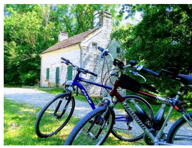
Lockhouse 22 -- Pennyfield

Preservation revenue from the program, however, was seriously impacted by the pandemic. The three-month closure resulted in a loss of fee income of more than $32,000, and enhanced cleaning between guests increased expenses for the program by more than