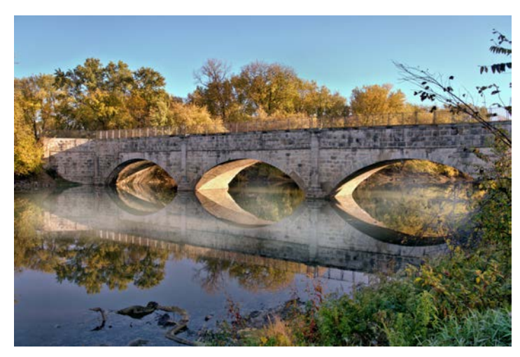
Conococheague Aqueduct

Our success in meeting this challenge was due in no small part to you – our donors and volunteers. Your generosity in 2019 allowed the Trust to meet the early headwinds of the pandemic in a solid position, and we moved quickly to benefit from available pandemic-