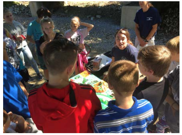
Students attending Canal Classrooms in Williamsport

In FY20, Trust donors contributed $49,200 in support of Canal Classrooms.