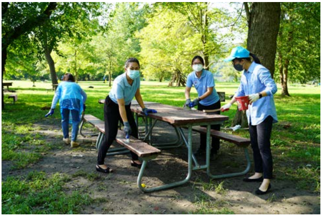
Volunteers from the Royal Embassy of Thailand

As restrictions were eased, we were able to undertake more complex projects. In August, the Trust worked with volunteers from the Royal Embassy of Thailand to pick up trash and paint picnic tables at Fletchers Cove. Our program team also recruited volunteers who in August and September removed 32 old tires at Violettes Lock, and painted the mule barn and spread mulch at Great Falls. In addition to organized events, the Trust recruited volunteers to go into the Park on their own time to pick up trash.