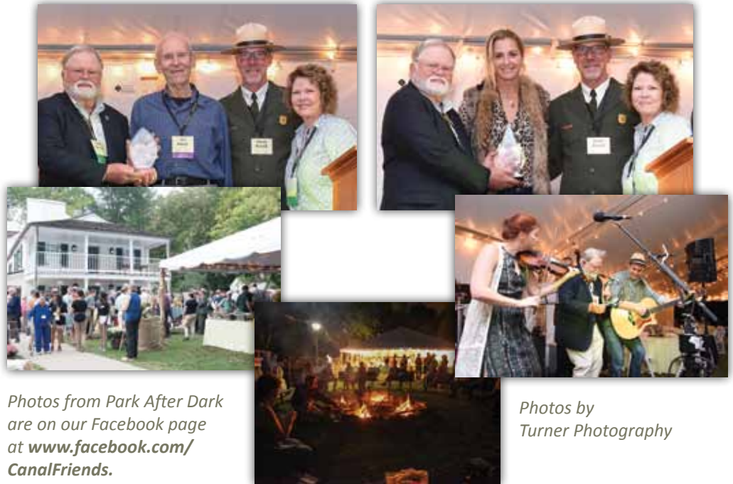
Photos from Park After Dark are on our Facebook page at www.facebook.com/CanalFriends .