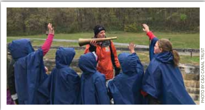
A member of the Canal Classrooms Corps explains to Hancock Elementary School fourth graders how canallers used a horn to alert the lockkeepers of their approach.