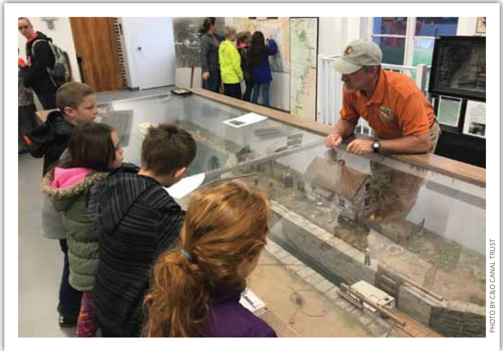
Students examine a model of the C&O Canal, housed in Williamsport, while discussing the operation of the canal with a Canal Classrooms Corps member.

The program seeks to inspire life-long learning through hands-on, curriculum-