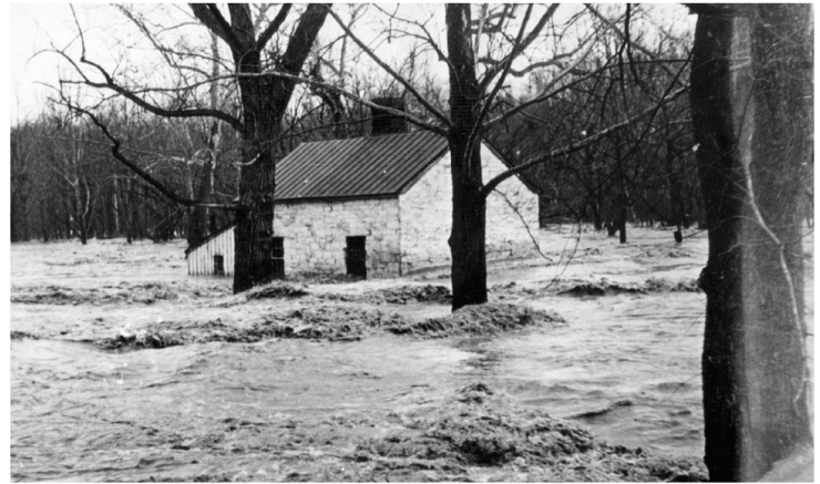
Lockhouse 6, downstream of Swains Lockhouse, was surrounded by flood waters during the 1936 flood.

Electrical outlets and switches on the first floor will all be located above the flood zone, which is up to three feet above the interior finished floor (per Federal Emergency Management Agency standards). Mini split HVAC units will be hung on the wall near the ceiling—out of the flood zone. Outside