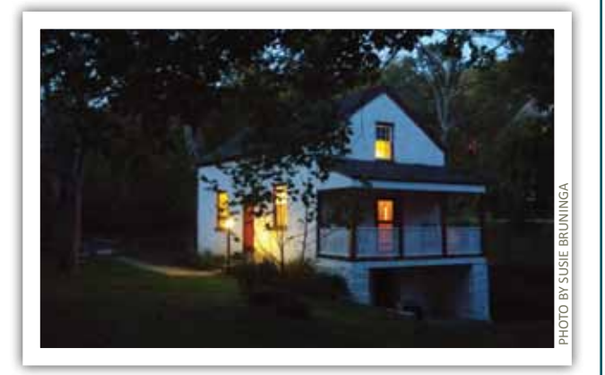
Lockhouse 6 in Brookmont.

Stays run from $110-$160 a night, depending on the lockhouse, and each sleeps eight people. Weekends book up fast, so be sure to reserve your stay soon, or buy a gift certificate as a perfect holiday gift! Visit the website at www.canaltrust.org/quarters for more detail.