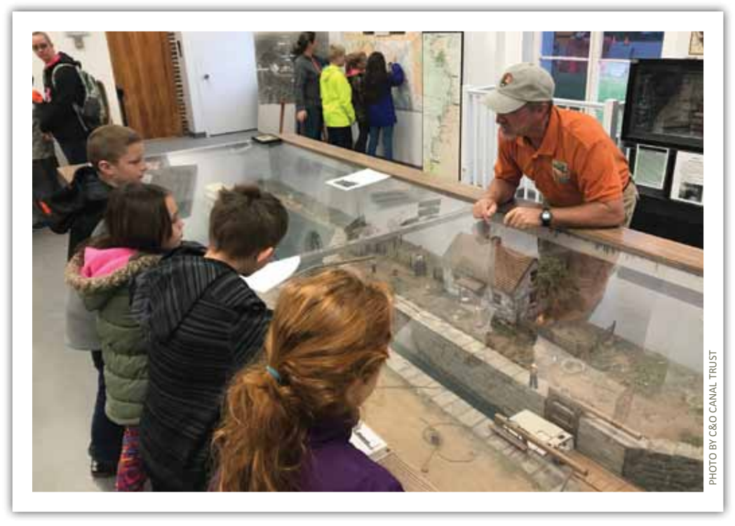
Students examine a model of the C&O Canal, housed in Williamsport, while discussing the operation of the canal with a Canal Classrooms Corps member.

The program seeks to inspire life-long learning through hands-on, curriculum-