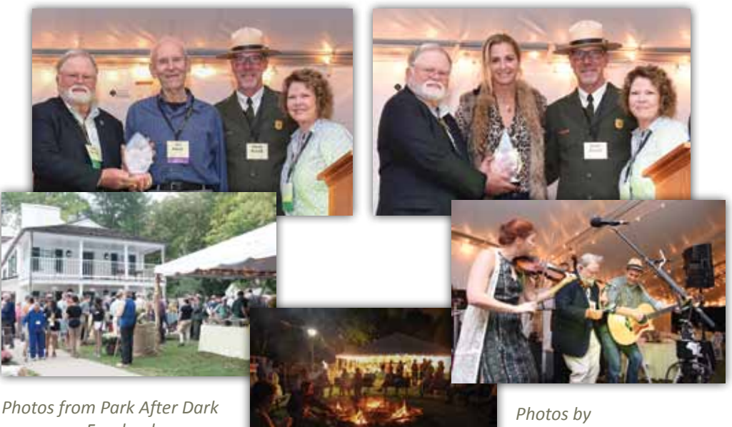
Photos from Park After Dark are on our Facebook page at www.facebook.com/ CanalFriends.