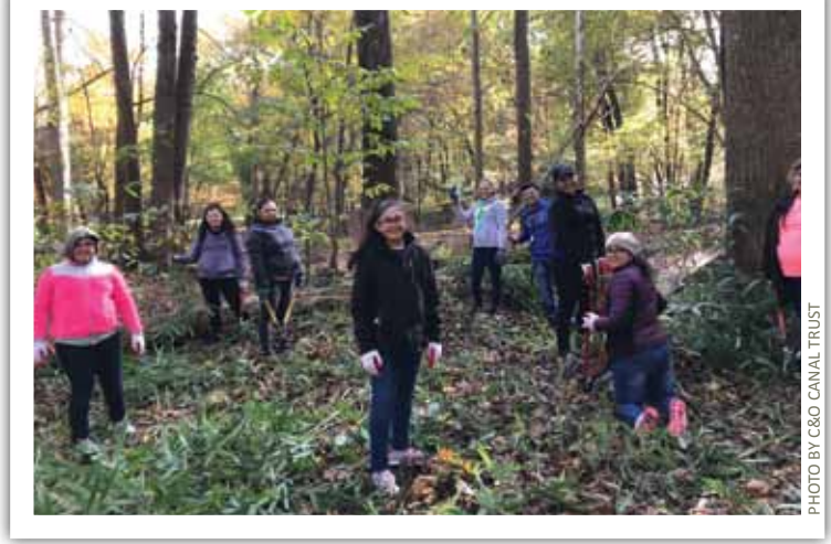
Community Bridges volunteers tackle the bamboo growing at Great Falls as part of the Trust's new Canal For All initiative.

The volunteers, which included Community Bridges members and their families, removed an entire patch of bamboo and sent it to the Smithsonian National Institute, which